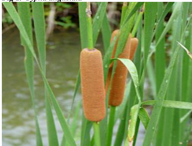
Fig 1. Typha angustata